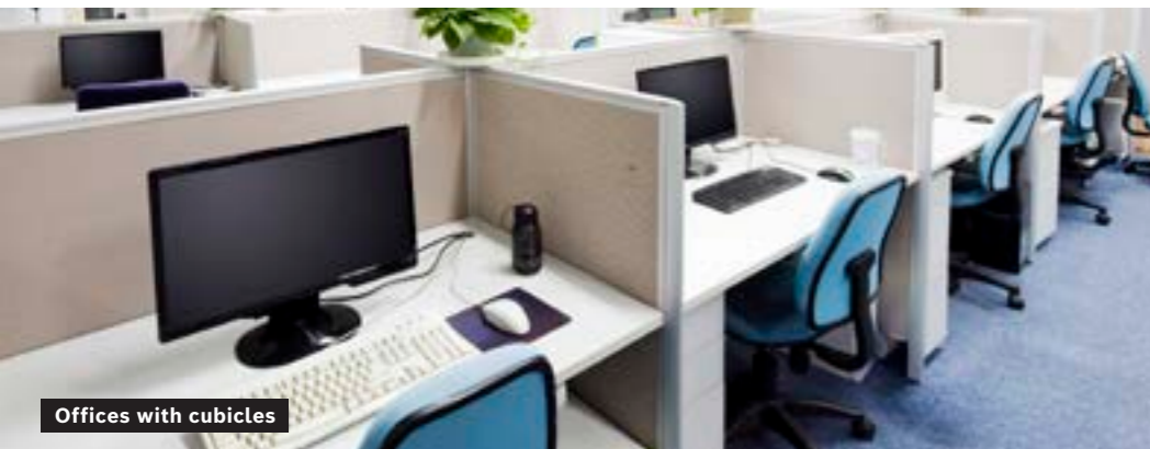
Offices with cubicles

Easy adjustment of the detection field large dials + adjustment table