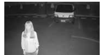
Advanced IR technology (can identify close and distant objects)