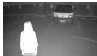
Conventional IR technology (cannot identify close objects due to overexposure)